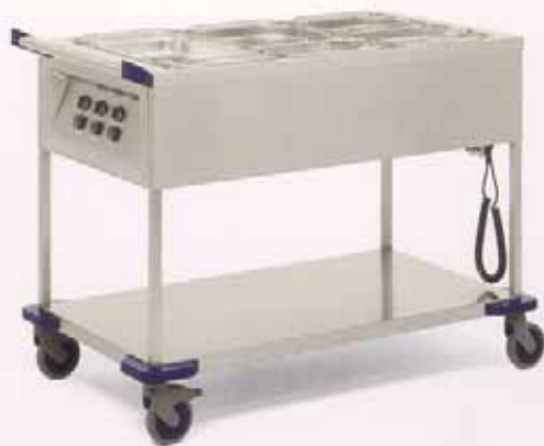
FOOD SERVING TROLLEY SAW 3 with accessories