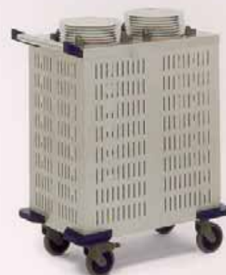
PLATE DISPENSER 2 SEK 21-26 with accessories