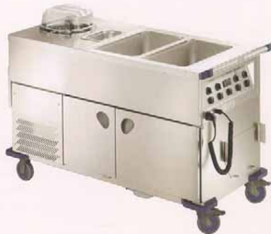
FOOD SERVING TROLLEY SAG 2-THK