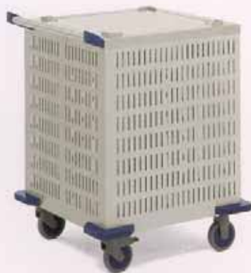
BASKET DISPENSER CEK 53/53

Its high-quality construction and its economical price make BLANCO INMOTION a true highlight in professional food distribution.