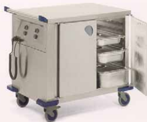
FOOD TRANSPORT TROLLEY STW 2 with accessories