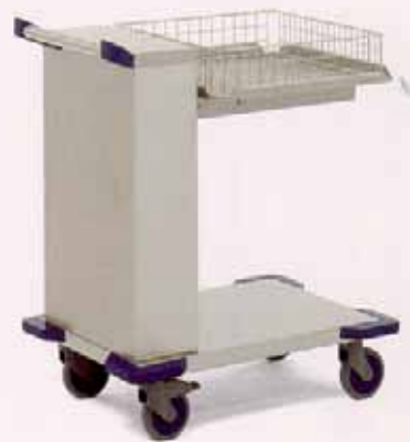
BASKET DISPENSER CCE 53/53 with accessories