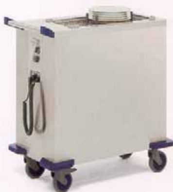
UNIVERSAL DISPENSER UNI-H 59/29 with accessories