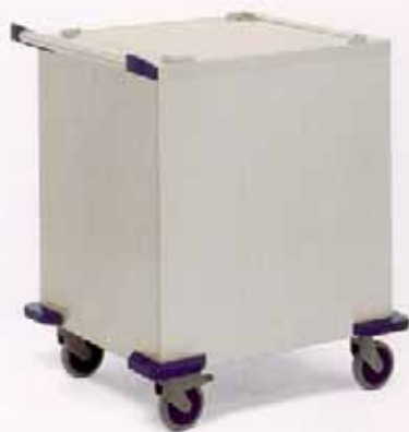
PLATFORM DISPENSER CE 58/58

To make sure that neither your furniture nor the trolleys are damaged, we have introduced new corner bumpers with the BLANCO INMOTION product line.