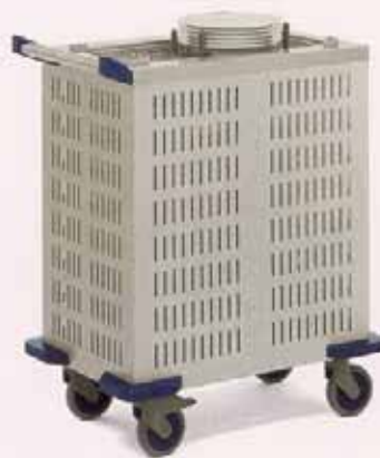
UNIVERSAL DISPENSER UNI-K 59/29 with accessories