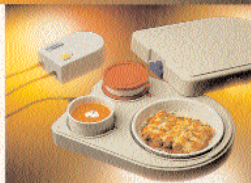
BLANCO CASA CONTACT

BLANCO CASA CONTACT and BLANCO GRANDE CONTACT.